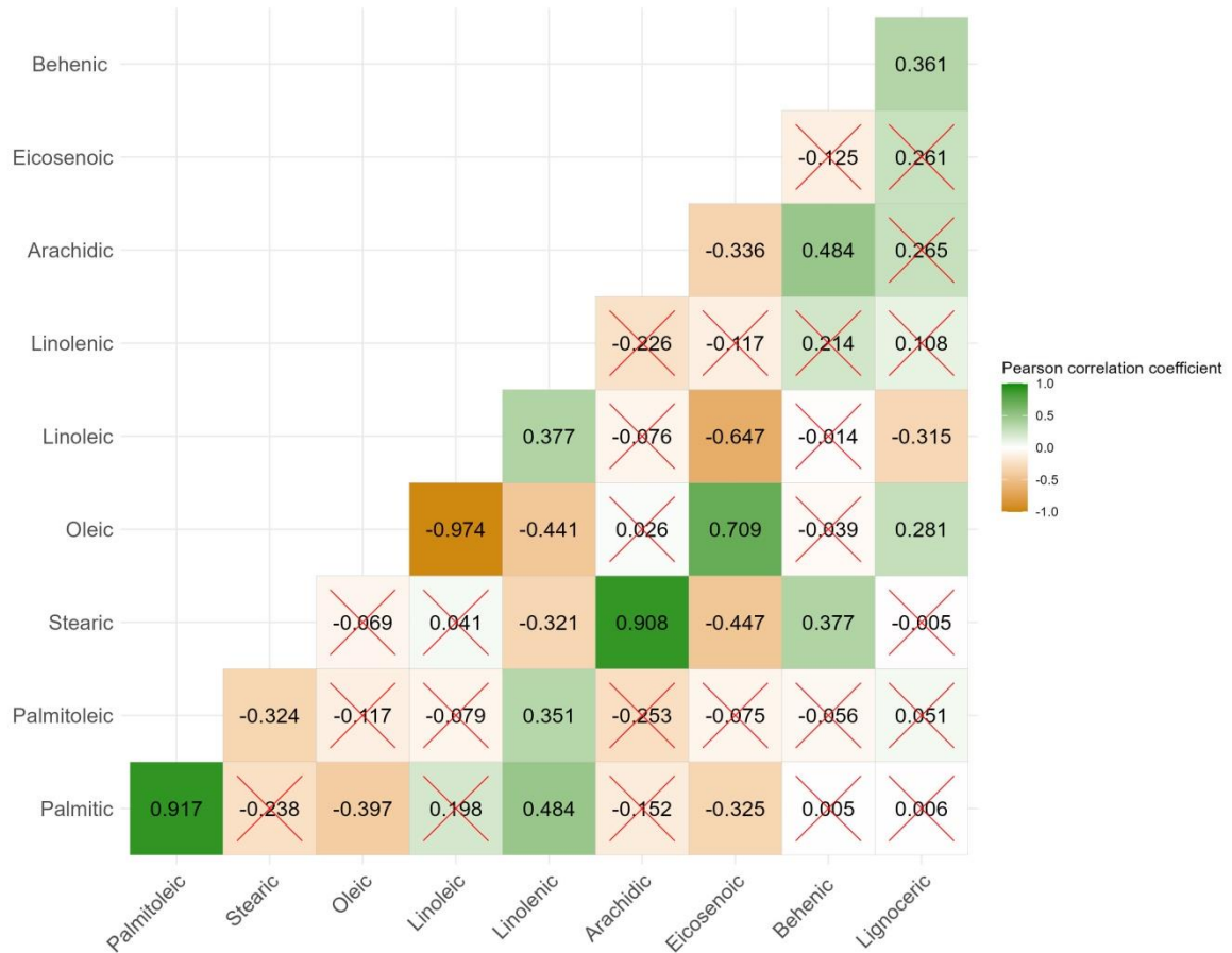
Figure 3. Correlation coefficient for the content of fatty acids in seed oil in the lines of the sunflower genetic collection